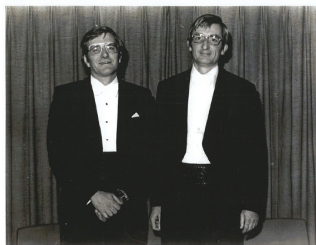
With Maxim Shostakovich after a concert at the Royal Festival Hall (both born on the same day!?)